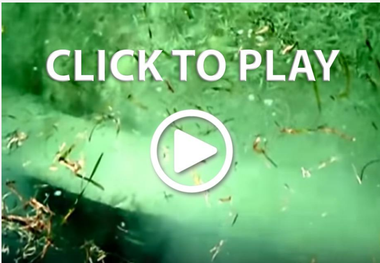
Click to view IMS 7012 Versi-Dredge dredging sand and sea grass in the Caribbean

Dredge operators will see the value of the Pump Defender. If they don't have to shut down 8-9 times a day to clean off their debris screen then they can improve operating efficiency, save diesel fuel, reduce labor costs, and stay ahead of schedule.