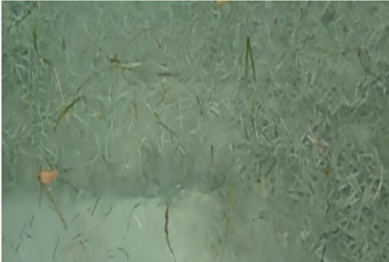
The Pump Defender reduces downtime for a project in the Caribbean where dense sea grass covered the sand in the entire dredging zone.

The Pump Defender has operated in heavily polluted waterways in SE Asia and reduced downtime by up to 90%. Additionally, the Pump Defender works well in heavy sea grass that can clog traditional debris guards and pumps.