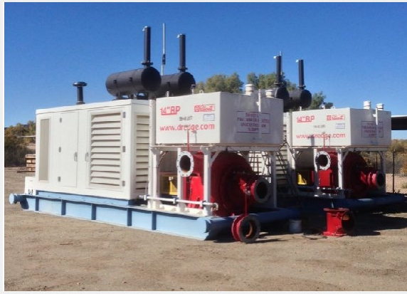
Custom-built Booster Pump