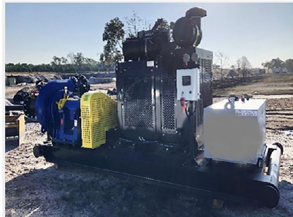
12-inch Booster Pump