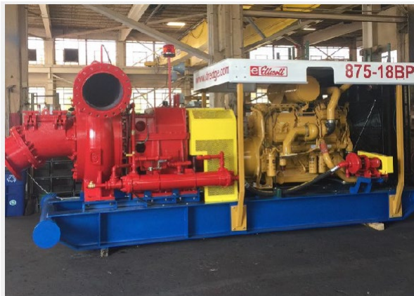
18-inch Booster Pump