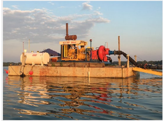
Floating Booster Pump Set-up